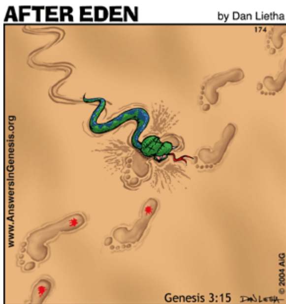
Saviour crossing (See Genesis 3:14-15)

Jesus shouted and then died . At once the curtain in the temple tore in two from top to bottom. A Roman centurion (army officer) was standing in front of Jesus. When the officer saw how Jesus died, he said, "This man really was the Son of God !"