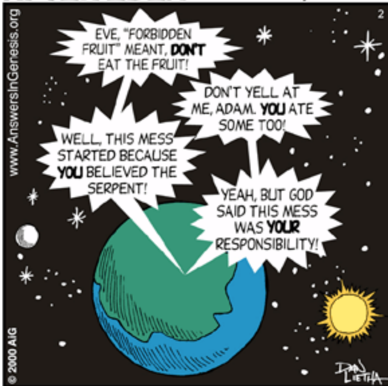
The actual First World War