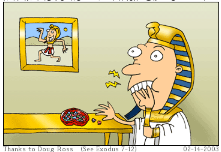
AND ONCE AGAIN, THE PHARAOH'S CANDY HEARTS WERE HARDENED