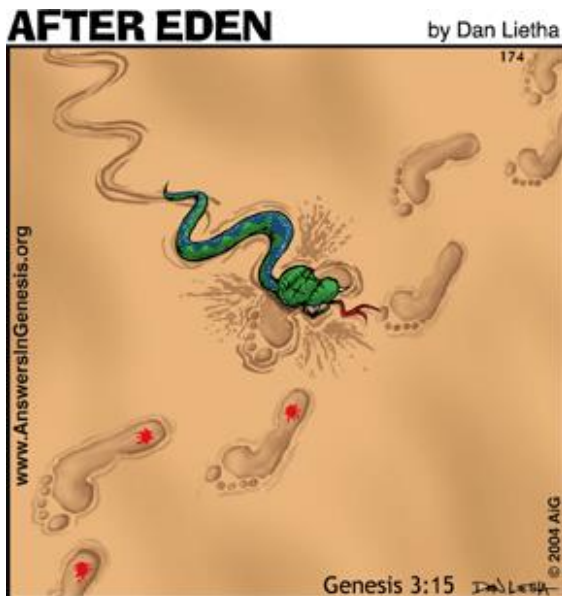
Saviour crossing (See Genesis 3:14-15)

Jesus shouted and then died. At once the curtain in the temple tore in two from top to bottom. A Roman centurion (army officer) was standing in front of Jesus. When the officer saw how Jesus died, he said, "This man really was the Son of God !"